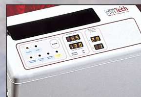
STAGE IV 2000

STAGE IV system includes the controller, mattress replacement and coverlet. A mattress overlay is also available.